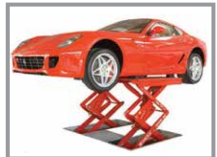
▲ Flush or Surface Mounted