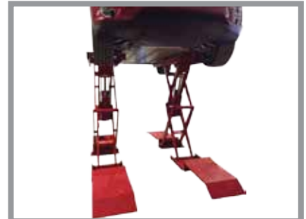
▲ Retractable Pull Decks 82.7" / 2100mm