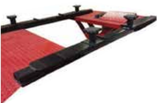
Adjustable frame engaging truck adapter