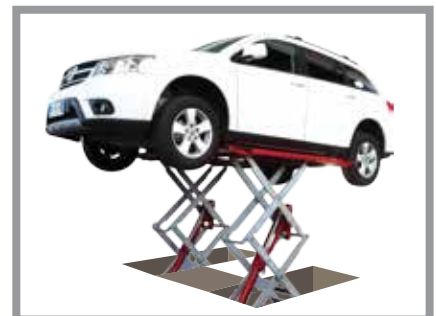
▲ Flush or Surface Mounted