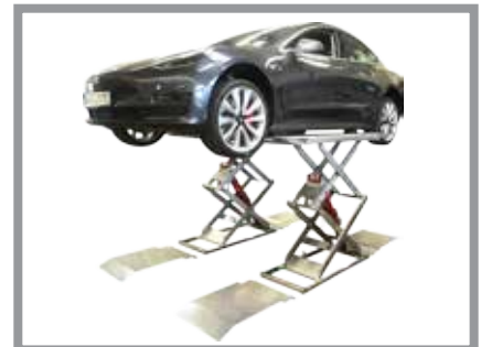
▲ Extended Ramps for low clearance vehicles and Hot-Dip Galvanization as optional accessories