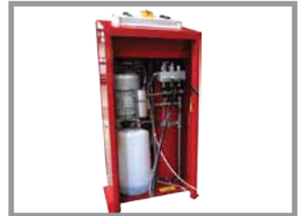
▲ Volumetric Control