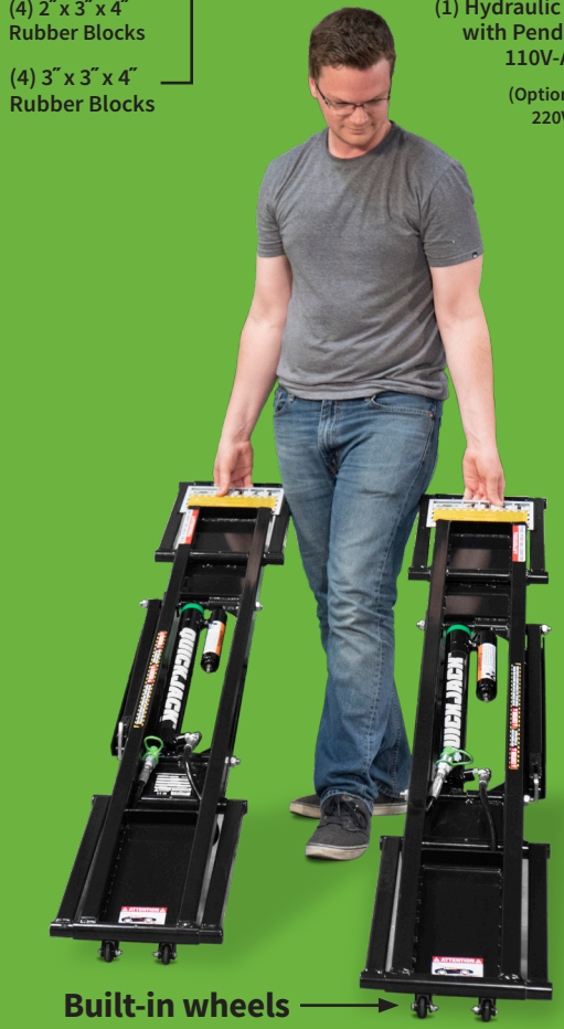
Built-in wheels →

The QuickJack replaces clumsy floor jacks and unstable jack stands with a safe, durable and convenient vehicle jacking and support system. Simply position the lightweight jack frames under the vehicle, push the raise button on the hand-held pendant control, and in seconds the entire car is about 21" off the ground, ready for tire changes, chassis tuning or other maintenance.