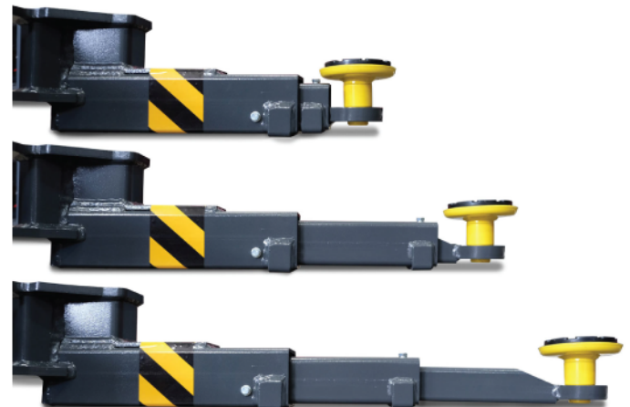
Front and Rear 3-Stage Telescoping Arms